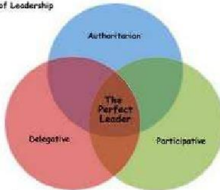
Styles of Leadership

The three major styles of leadership are (U.S. Army Handbook, 1973) :